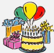
OUR PASTOR'S BIRTHDAY

My beloved Parishioners, Wednesday, July 4 th , 2018 will make six years that I joined St. Benedict the Moor Church family. I must tell you that being a member of this gracious family is not only a privilege, but a special blessing to me. I thank God each day that I am in a place that I feel so much at home and working with people that I consider my own family.